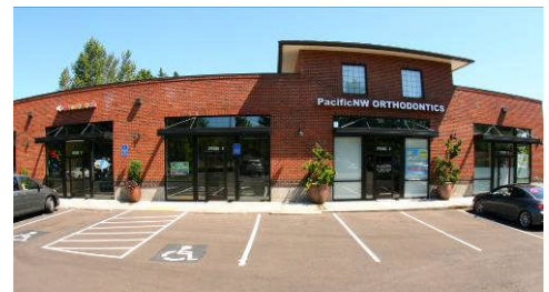
Typical wide angle lens